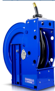
FLOOR OR CEILING MOUNT