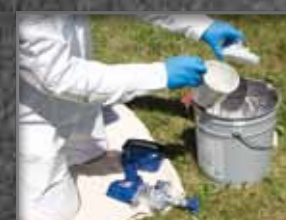
Dispose of cup liner and lid.