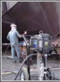
If you use this...

Same “at the tip” performance as the largest sprayers. Spray the same coatings, get the same results!