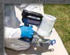
Attach cup with solvent, set to "Clean" and run upside down.