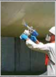
You NEED this!

Allows you to have up to 2 gallons (7.6 liters) of material ready-to-go for uninterrupted spraying.