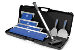
ProSurface Drywall Kit (18C676) shown

For More information visit graco.com/ProSurface