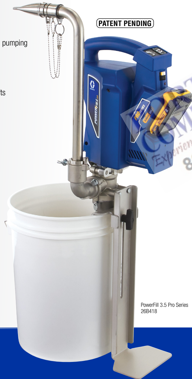
PowerFill 3.5 Pro Series 26B418